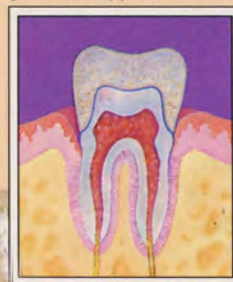
Your teeth will be fitted with provisional coverage until your next appointment.