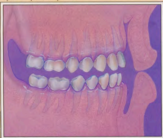
A full compliment of teeth.